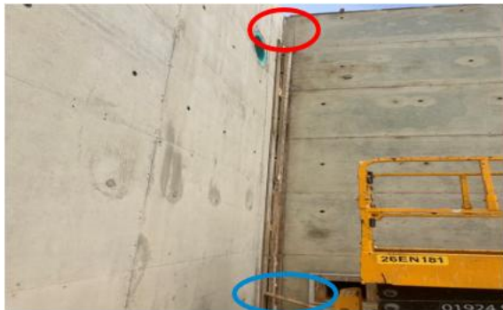
Photo 1: Red circle- the location that the timber fell after becoming dislodged before proceeding to lift out the shutter.

Blue circle- A piece of timber fell from the location marked by the red circle and struck the IP on the lip.